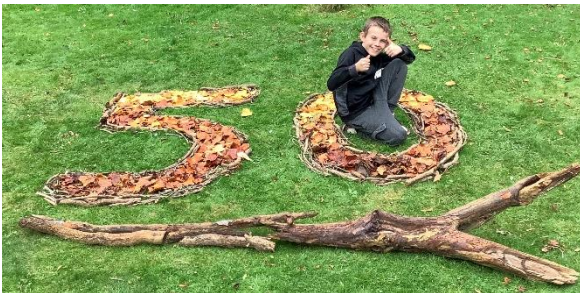
50 is that, this year, Holywell is 50 years

... and the reason for the appearance of the number